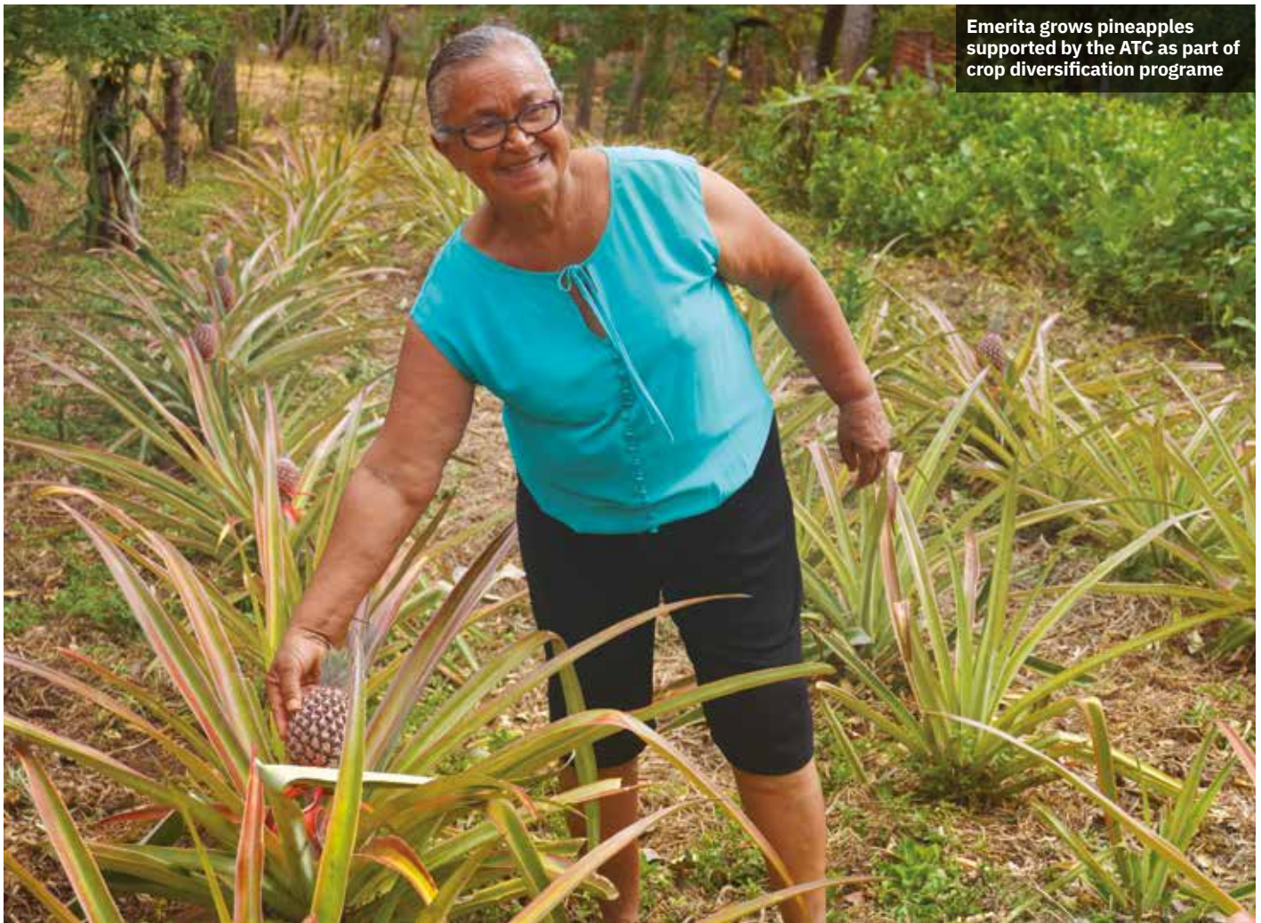
Emerita grows pineapples supported by the ATC as part of crop diversification programme

their rights, and some were killed and wounded. The roads weren't maintained so they became unpassable again. The infamous 'blackouts' meant that we had electricity for only six hours a day. In the hospitals and health centres there were no medicines. In the schools, we [even] had to pay to take tests. Everything went backwards and people got tired of it.