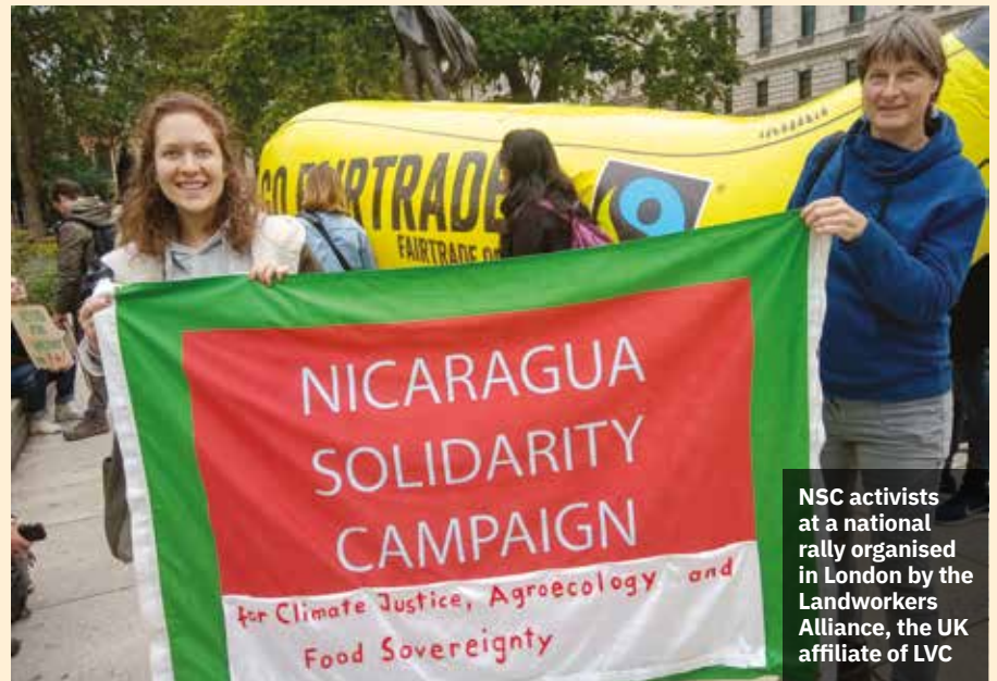
NSC activists at a national rally organised in London by the Landworkers Alliance, the UK affiliate of LVC

In the context of the COVID crisis the second cohort of 40 students from Mexico, Central American and the Dominican Republic started their online course on 15 April this year. This means the challenges – and some advantages – of Moodle, Zoom, and Whatsapp.