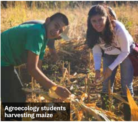
Agroecology students harvesting maize