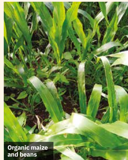
Organic maize and beans

The ATC formed part of a broad alliance that brought the Sandinista government to power in 1979. Agrarian reform was fundamental to building a new society based on social and economic justice.