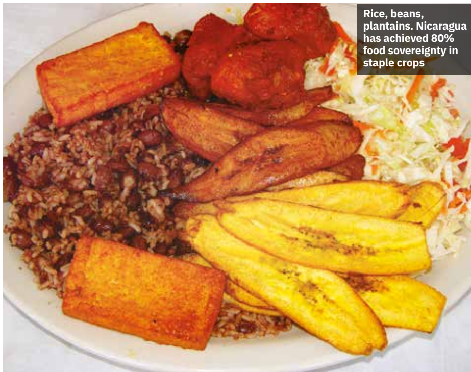
Rice, beans, plantains. Nicaragua has achieved 80% food sovereignty in staple crops