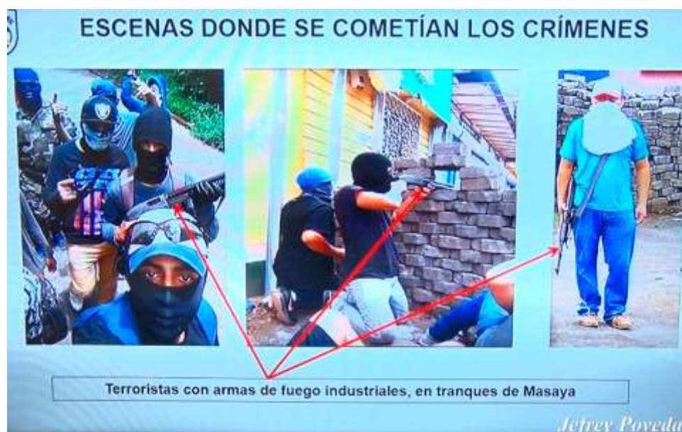
Police photographic evidence showing use of conventional weapons by the opposition in Masaya