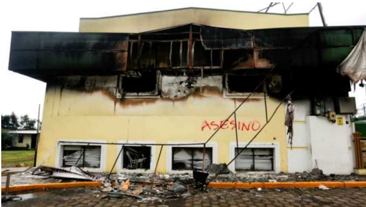
The Caruna building (Cooperativa de Ahorro y Crédito) after its destruction on May 30.