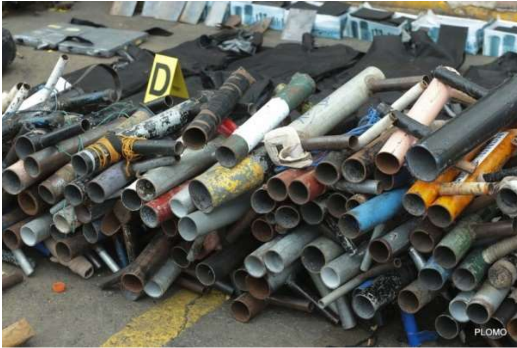
'Homemade' mortars recovered from the UNAN.