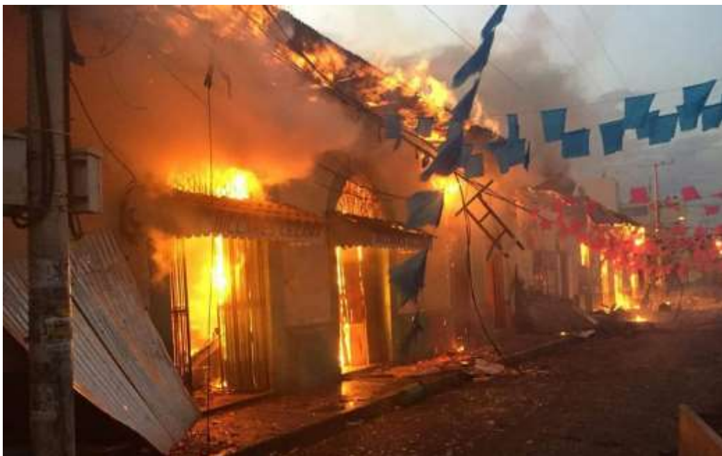
Protesters set fire to public buildings in León (here), Managua, Granada, Masaya and other cities.

In addition to the violence against the public, the roadblocks and the 'no go' areas they created were the base for huge destructive attacks against public buildings, businesses and private homes. Some 252 buildings were burnt down or ransacked, including many private homes. Nearly 400 vehicles – in many cases police vehicles and ambulances – were destroyed. Some 278 heavy items of machinery were damaged or destroyed. The effects on Nicaragua's health service are described in this video . The cost in damage to public sector property and vehicles alone is estimated at US$ 231 million.