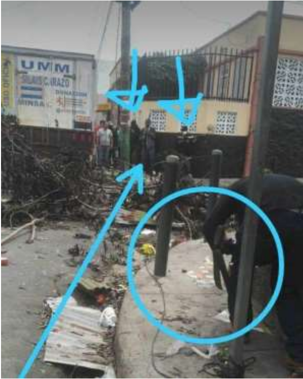
Conventional weapons in use by the opposition in Jinotepe