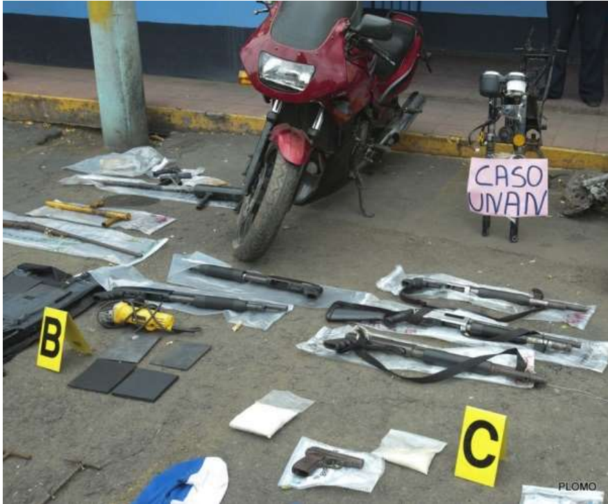
A small selection of weapons found during arrests connected with violence in the UNAN

The remainder of this section concerns events in mid-July, the period of the incidents covered by AI.